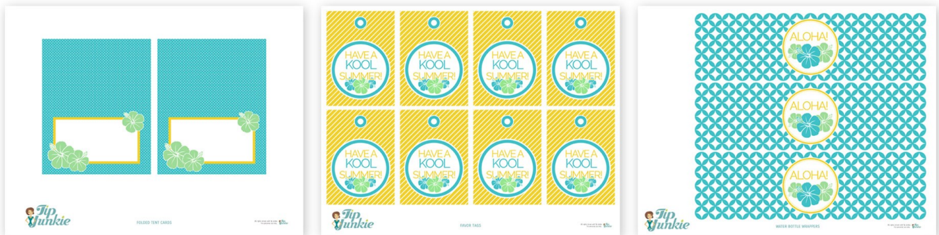
FOLDED TENT CARDS